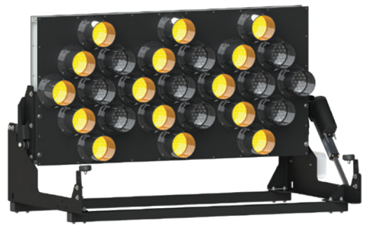
Power Tilt mount representation