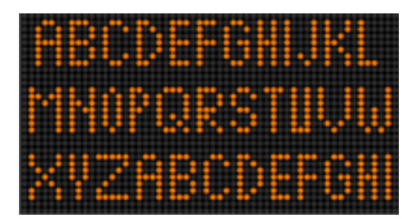
3x7 font (up to 12 characters)