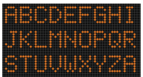
Default 5x7 font (up to 9 characters)